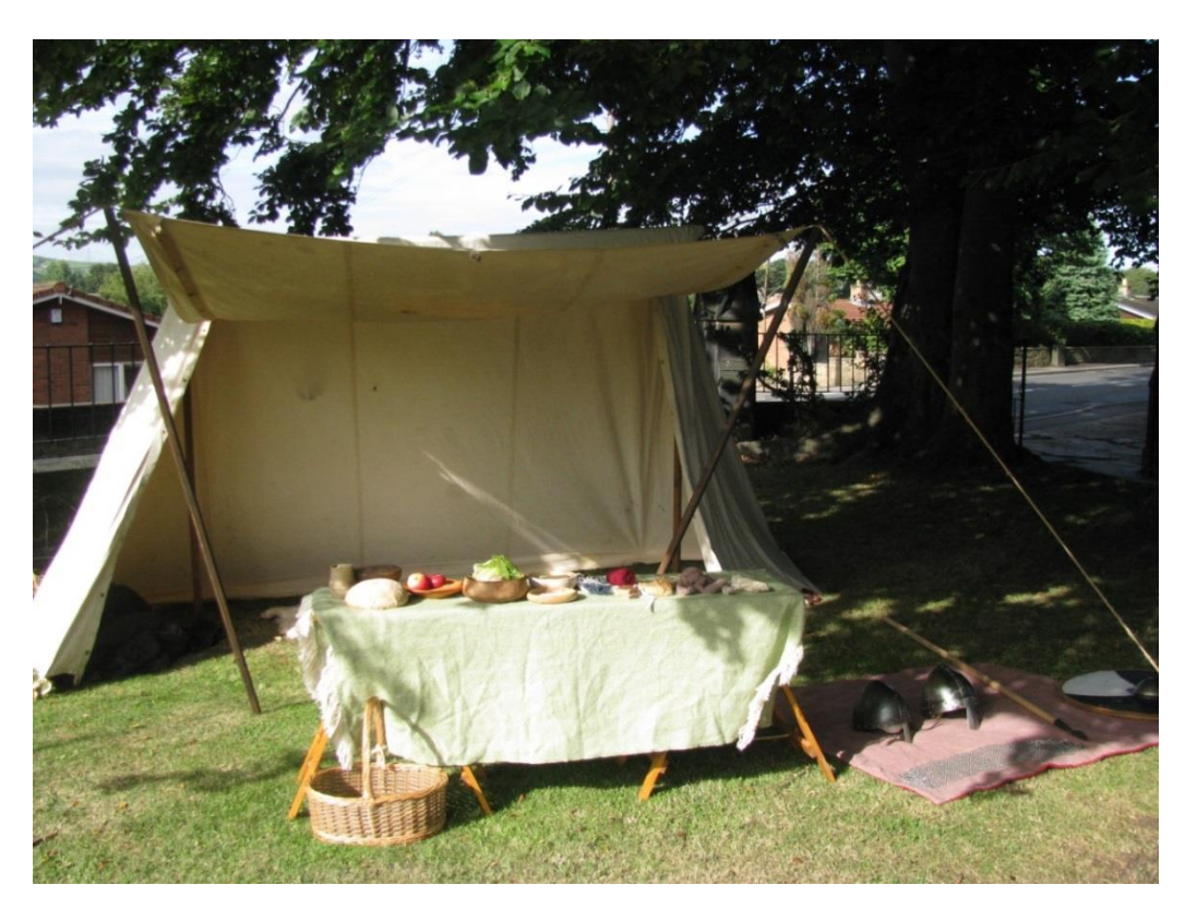
Regia Wic Cookbook