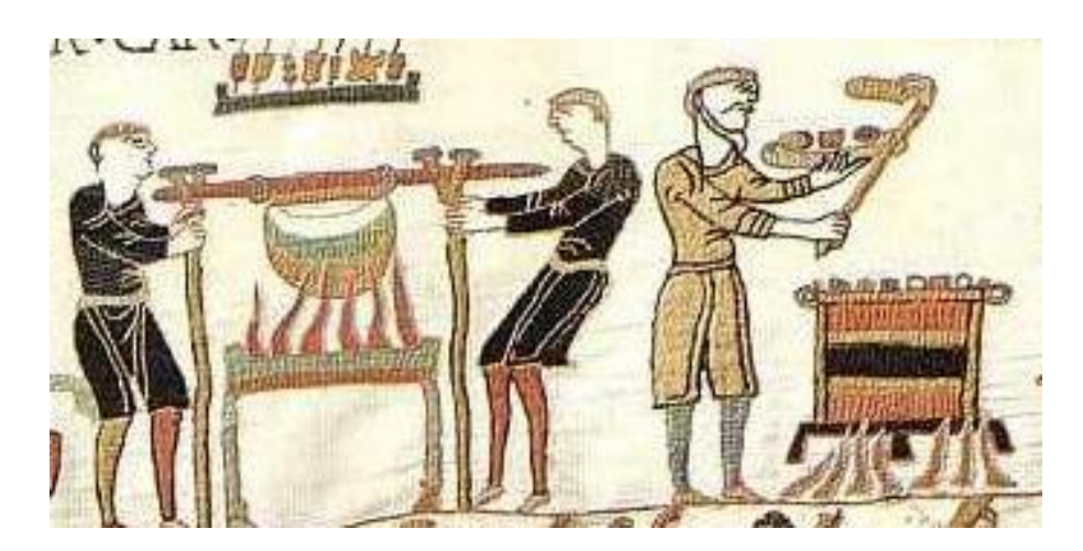
Regia Wic Cookbook